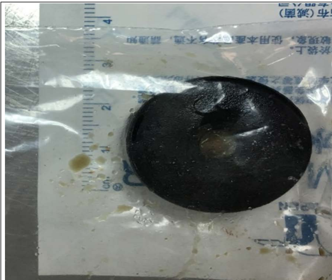
Figure 4. Foreign body was removed from esophagus by surgery.