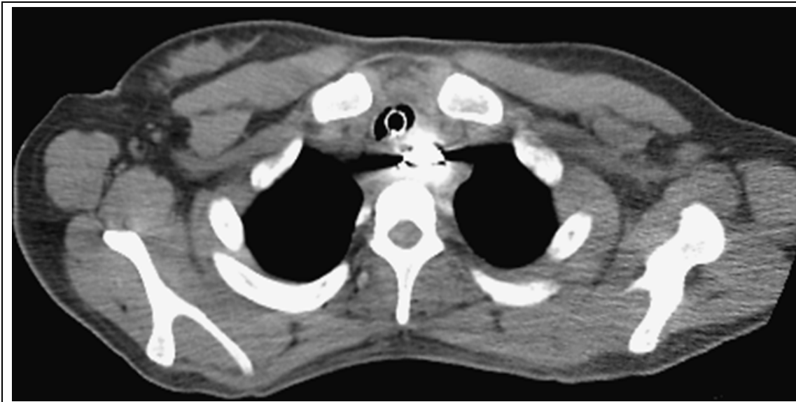
Figure 3. Radiopaque foreign body was found in esophagus