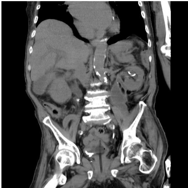
Figure 2: A left kidney to psoas muscle fistula was noted.