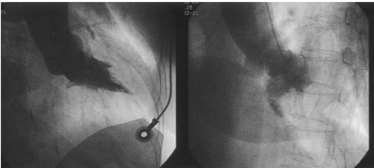
Fig.2. Left ventriculography showing no false lumen or intimal flap in the ascending aorta.