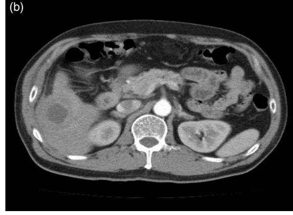
Figure 2. (a) Abdominal CT performed 14 days after TACE showed a large gas forming abscess; (b) three months after treatment showed regression of abscess and hepatoma in right liver lobe.