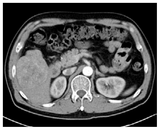
Figure 1. Four phase dynamic abdominal CT shows a lobulated hypodense lesion about 9.3 \times 7.2 \times 7.9 cm in size with early arterial enhancement and late venous phase wash out in segment 5 and 6 of right liver lobe, diagnosed as HCC.

A 10-French percutaneous pigtail drain was placed and cultures from the abscess grew